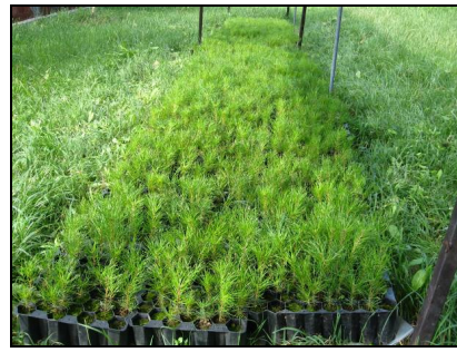
Figure 2. Pictures of seedlings, April 2010 Figure 3. Pictures of seedlings, September 2010