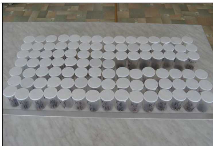
Figure 1. Overview of processed seeds prepared for analysis and planting in containers

Cone opening was done in the dryer at the temperature of 40 °C. Dehusking of seeds was done by hand while cleaning of seeds from inert matter was done in “van”. After that, the seeds were grouped by trees and locations and stored in a refrigerator at temperatures between 3 ° C and 5 ° C (Figure 1).